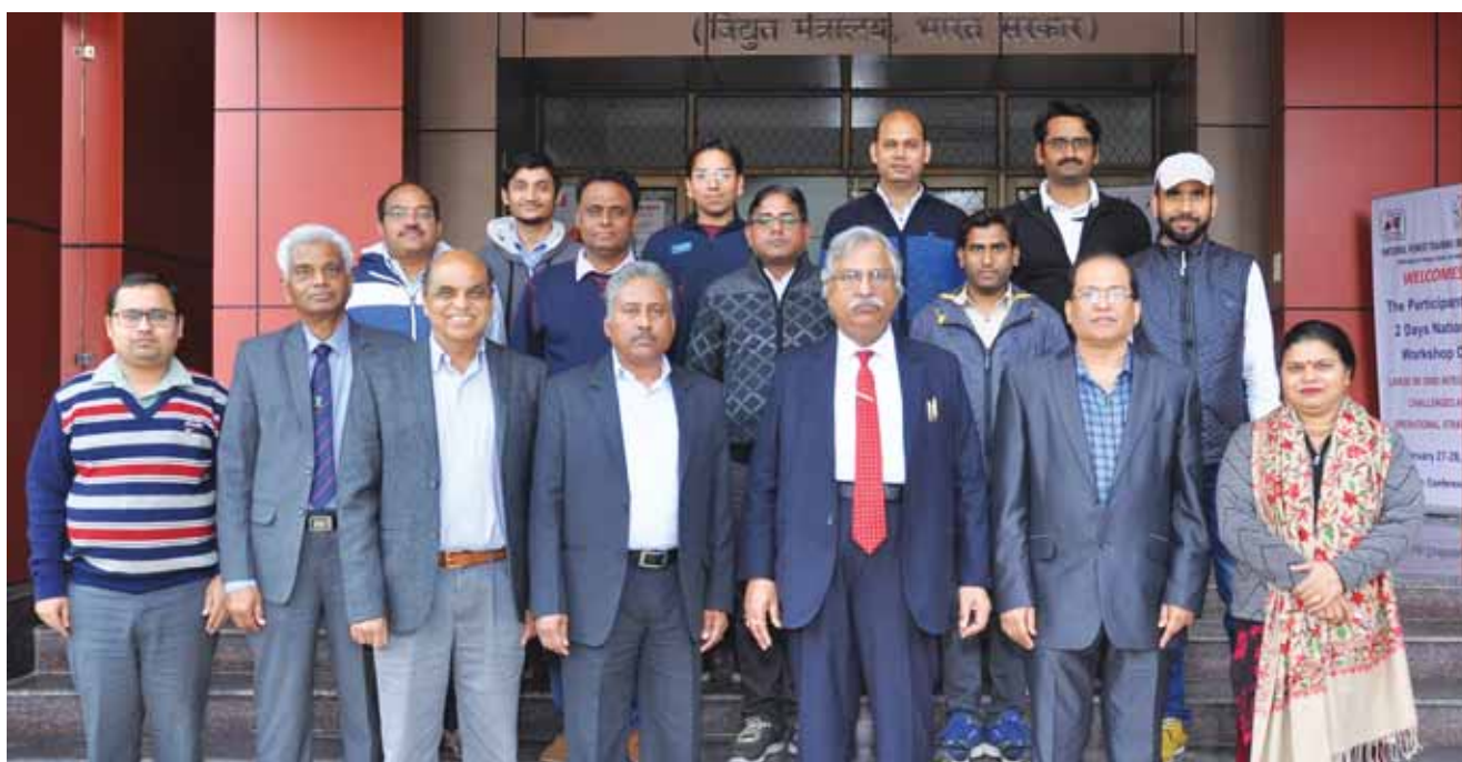
6 Days Training Program on Operation & Maintenance of Steam Turbine for NTPC Meja Participants at NPTI CO, Faridabad