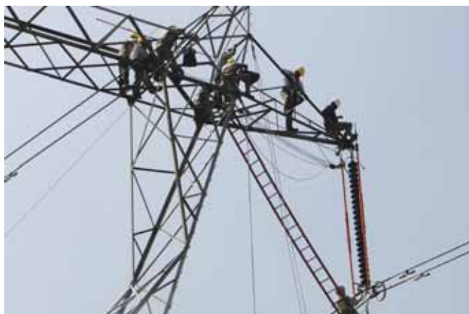
Training at HLTC - Bare Hand Method

A facility has been created at NPTI's Hot Line Training Centre (HLTC), Bengaluru for Live Line Maintenance of Transmission Lines upto 400 KV (first of its kind in Asia) which enables the trained personnel to attend the maintenance requirements without power interruptions. Facility for water washing of sub-station equipments is also available.