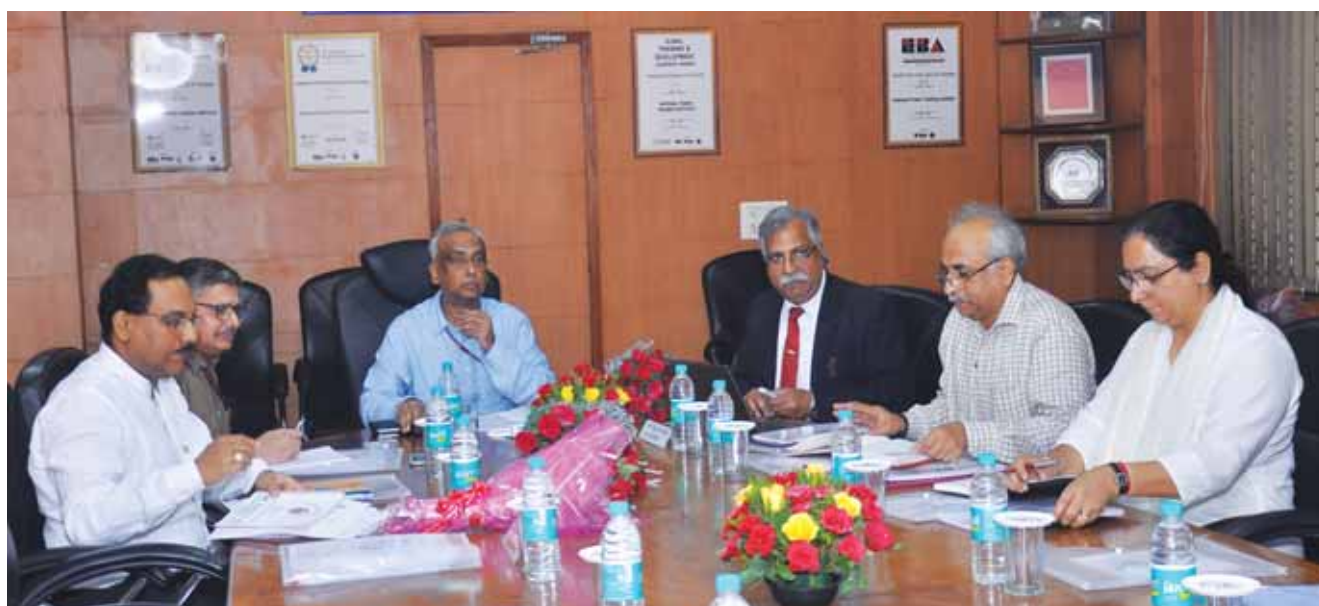
Visit of Ministry of Power Officials to NPTI Corporate Office