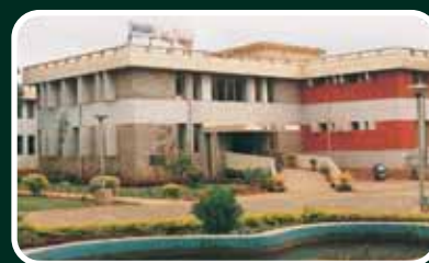
NPTI (PSTI) BENGALURU