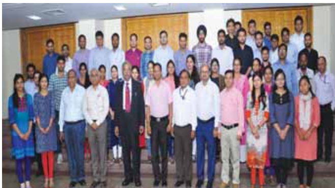
RRVUNL at NPTI (NR), Badarpur, New Delhi