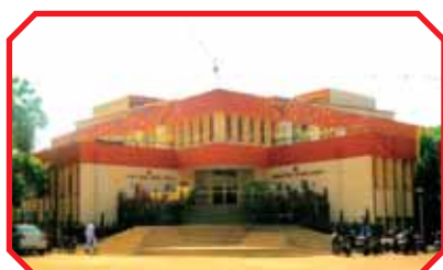
NPTI (WR) NAGPUR