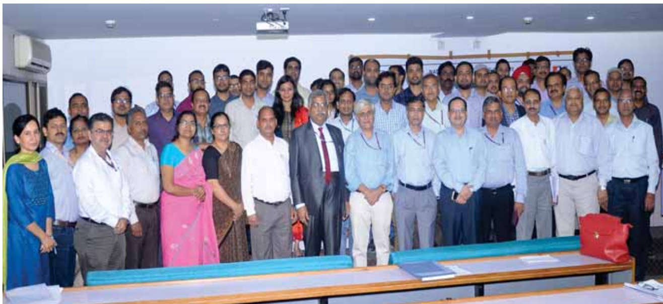
Inaugural Function of Induction Training Program of Assistant Directors, Batch-III at CEA, R.K.Puram, New Delhi

In the above different areas, NPTI will collaborate not only with the industries (IEEMA) for R&D in identified Thrust Areas as mentioned above but also would like to closely collaborate with Utilities and Power Sector Organisations for transfer of technology in process as and when R&D is matured.