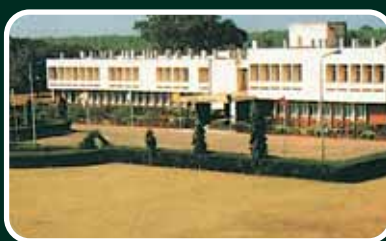
NPTI (SR) NEYVELI