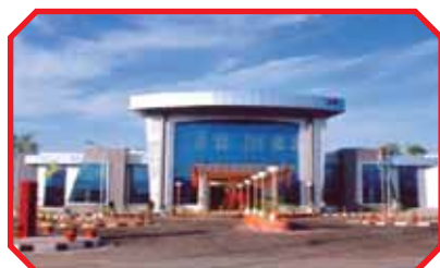
NPTI (HTPC) NANGAL

National Power Training Institute (NPTI), an ISO 9001 & ISO 14001 organization under Ministry of Power, Govt. of India is a National Apex body for Training and Human Resources Development in Power Sector and the world's leading integrated Power Training Institute, with its Corporate Office at Faridabad. NPTI operates on a Pan- India basis through its nine institutes in different power zones of the country. Apart from highly skilled and competent trainers and state of art laboratories, NPTI has Hi-tech real time simulators including, thermal (210 MW, 500 MW), CCGT (430 MW), Hydro (250 MW) and a Despatcher Training Simulator. NPTI has recently acquired a 800 MW Supercritical Simulator and is coming up with six multi-functional Simulators (Thermal: 210 MW, 500 MW, 800 MW; 550 MW CCGT; 250 MW Hydro; SCADA & Smart Grid Operations, RES-Grid Integration, Smart Power Flow Controller Modules in Integrated Framework) at its various branches. Having trained over 3,20,000 Power Professionals in regular programs over the last 5 decades, NPTI is the only institute of its kind in the world with such a wide geographical spread and covering a wide gamut of academic and training programs in Power Sector.