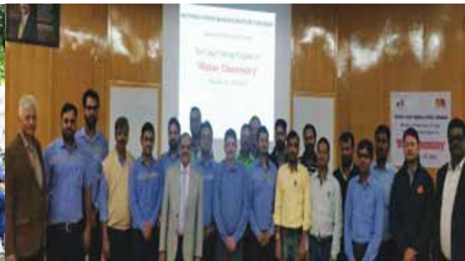
"Water Chemistry" program for Grasim Industries, Surat