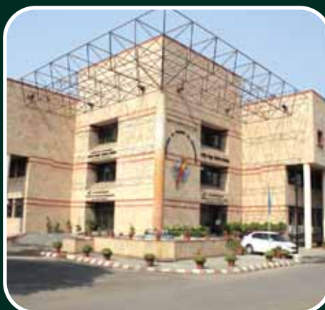
NPTI (CO) FARIDABAD