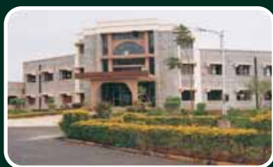
NPTI (HLTC) BENGALURU