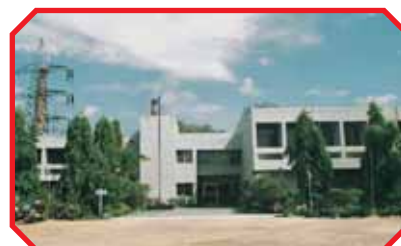
NPTI (NR) BADARPUR