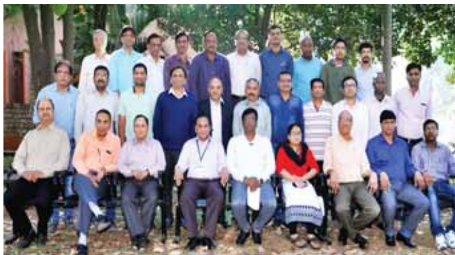
Specialist level System operation Training on "RE Sources and Grid integration", Jan 06 – 11, 2019 at PSTI Bengaluru