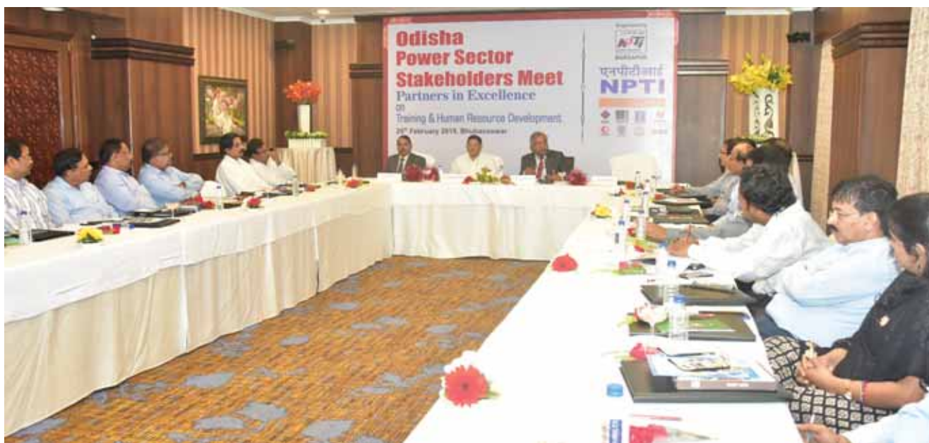
Odisha Power Sector Stakeholders Meet: Partners in Excellence on Training and Human Resource Development, Feb 25, 2019, Bhubaneswar

Who may attend : Finance persons working in Power Stations/Industry with 5 to 10 years of experience.