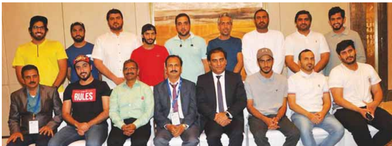
1 week Training Program on 'Electrical Protection System' for Abu Dhabi Distribution Company, UAE on 6-10 May 2018 by NPTI (PSTI) Bengaluru

Who may attend : Maintenance technicians with 2-3 years experience in the field.