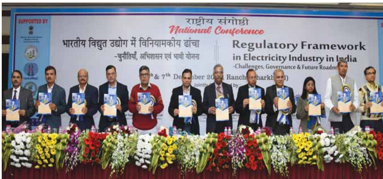
"Regulatory Framework in Electricity Industry in India- Challenges, Governance & Future Road Map", Dec 06 – 07, 2018, Ranchi