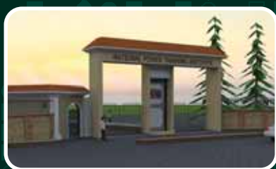
NPTI SHIVPURI MADHYA PRADESH