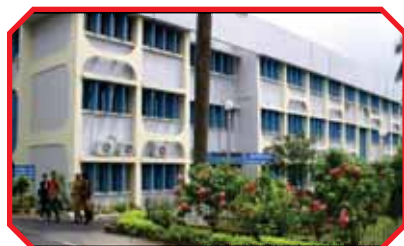
NPTI (ER) DURGAPUR