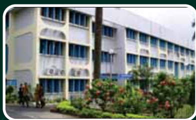
NPTI (ER) DURGAPUR