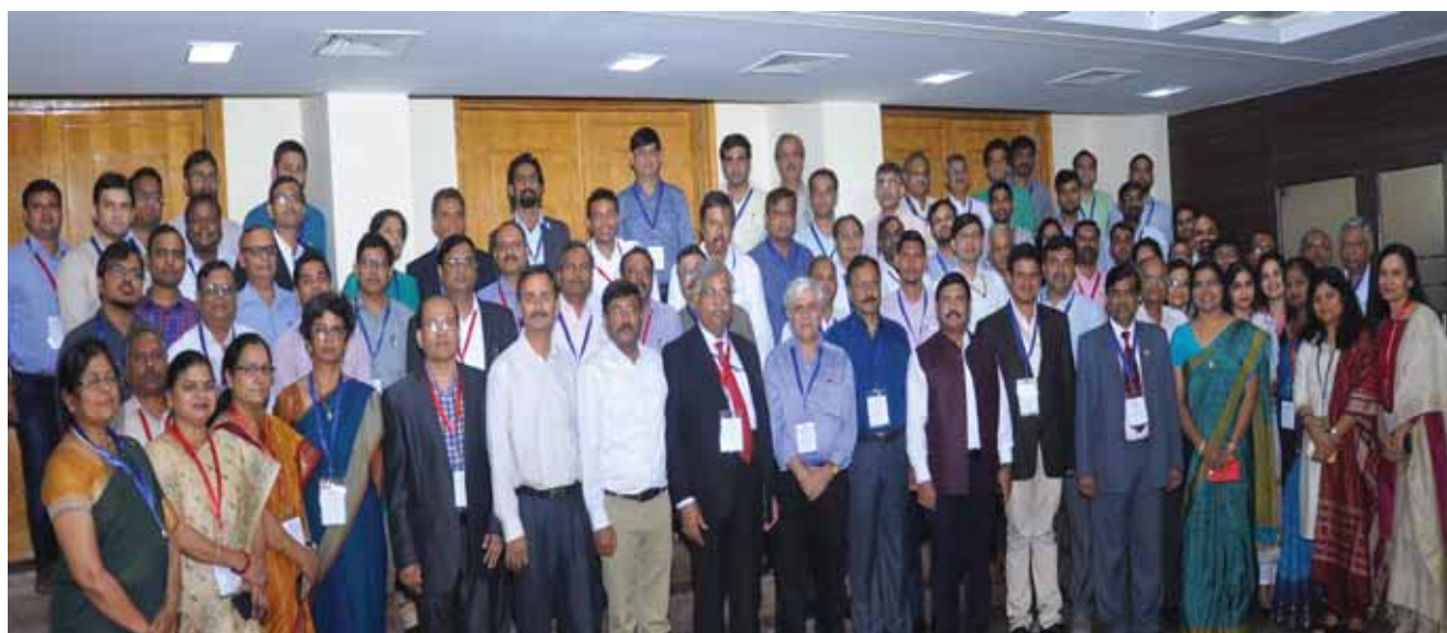
Power Sector Stakeholders' Meet, Oct. 03, 2018 at NPTI CO. Faridabad