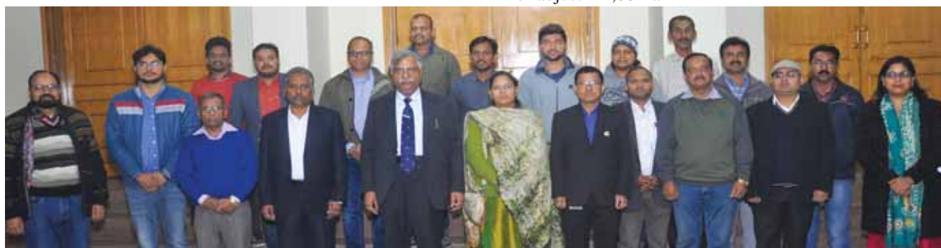
Training on "Measures relating to Safety of Electrical Supply" for executives of ONGC, Vadodara at NPTI CO. Faridabad