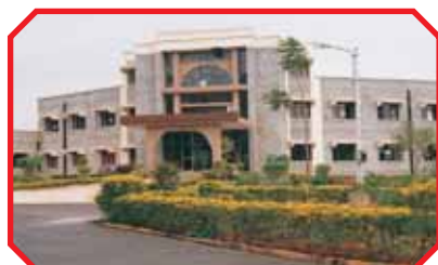
NPTI (HLTC) BENGALURU