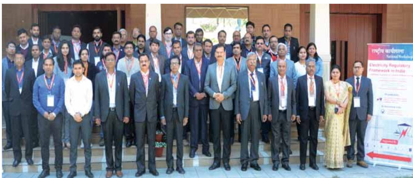
One Day National Workshop on "Electricity Regulatory Framework in India- Challenges, Regulations and Consumer Protection Perspective", March 15, 2019 at Dehradun