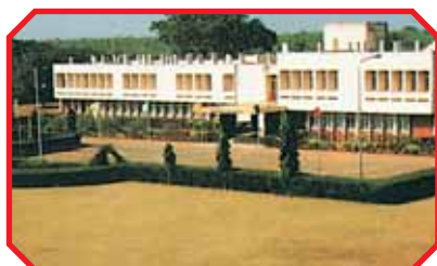
NPTI (SR) NEYVELI