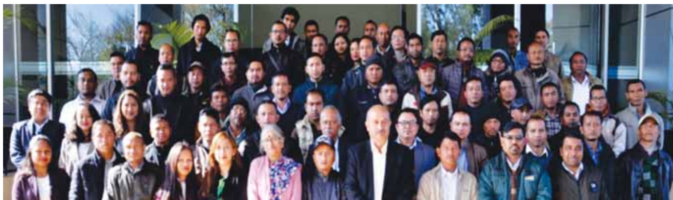
B.E.E. Sponsored One Day program for MeCL Shilling Discom Engineers on Distribution Transformer & Switch Gear MTCE & Loss reduction at Shillong