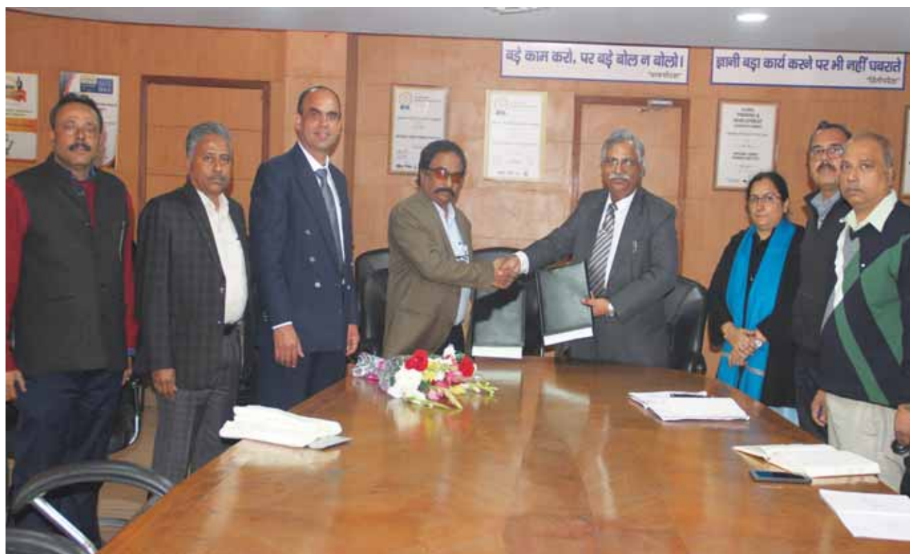
Signing of MoU between NPTI and MNIT, Jaipur at NPTI CO. Faridabad

Venue : PSTI Bengaluru Duration : 3 Days Date : August 28, 2019 Who may attend : Engineers working in the area of Distribution System