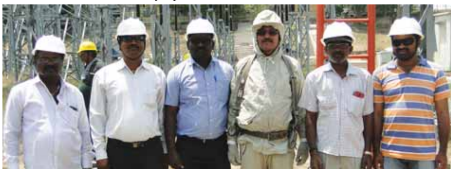
Training Personnel at HLTC, Bengaluru for Live-Line Maintenance