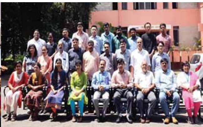
Two Days National Workshop on IEC 61850 Tools and Protocol Training with ASE 61850 Suite at PSTI Bengaluru