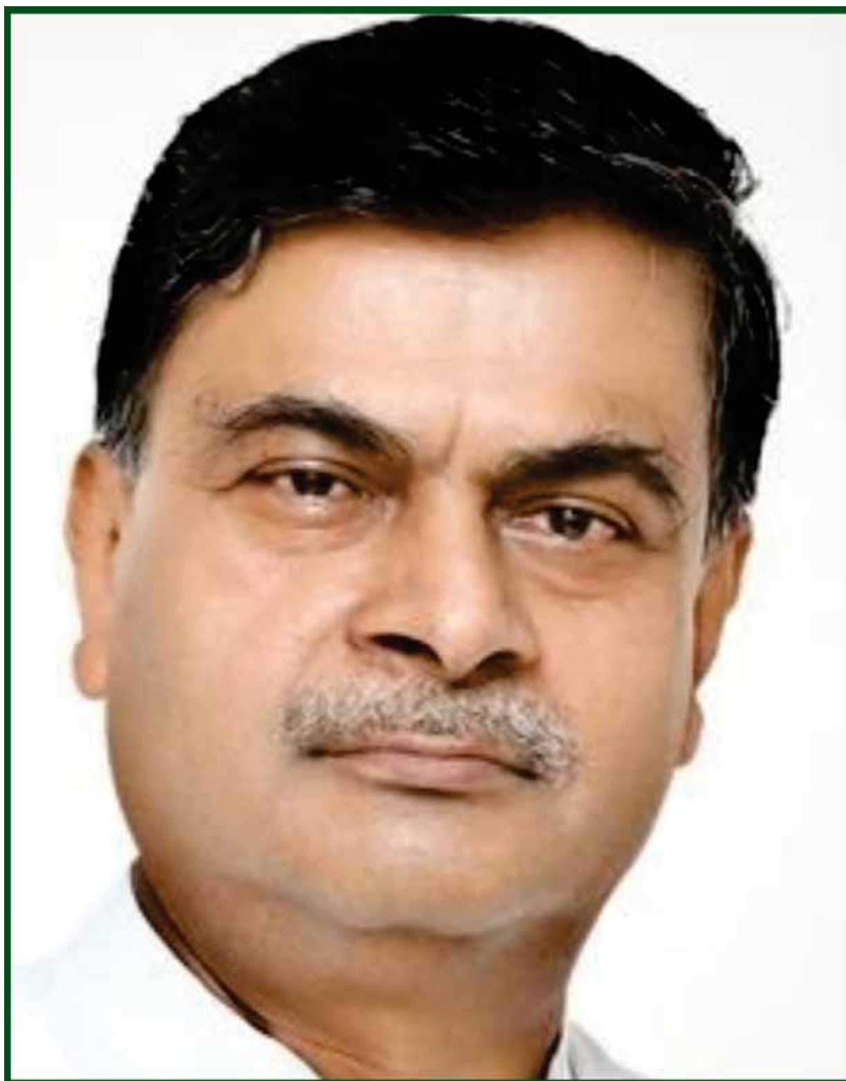
Shri R. K. Singh Hon'ble Minister of State (IC) (Power, New & Renewable Energy) & Minister of State (Skill Development and Entrepreneurship)