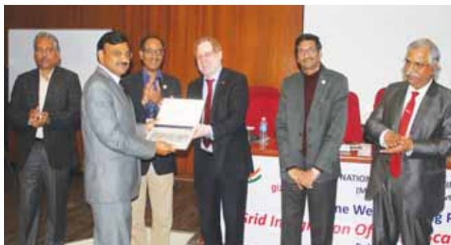
Grid Integration of Large Scale Renewable Energy, Feb 18-23, 2019 at NPTI CO. Faridabad

Venue : PSTI Bengaluru Duration : 3 days Date : September 04, 2019 Who may attend : Engineers involved in the Operation, Maintenance and Testing of Transformer from state Electricity Boards, Power Utilities, R & D organizations, Academic Institutions, Transformer manufactures transformer Oil processors and servicing organizations etc.