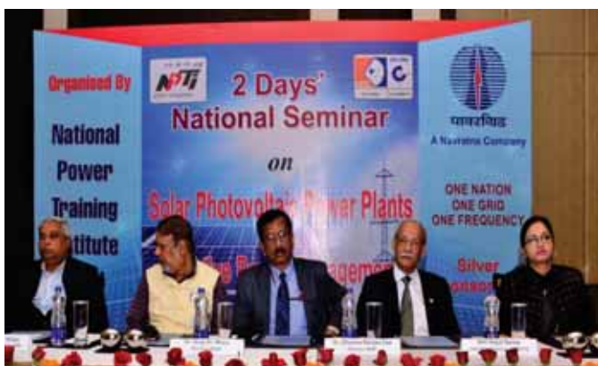
Inauguration Function of 2 Days National Seminar on Solar Photovoltaic Power Plants and Reactive Power Management on 3rd & 4th Dec 2018 at Guwahati