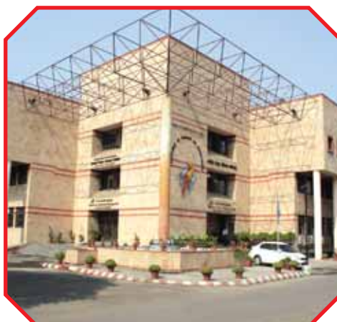
NPTI (CO) FARIDABAD