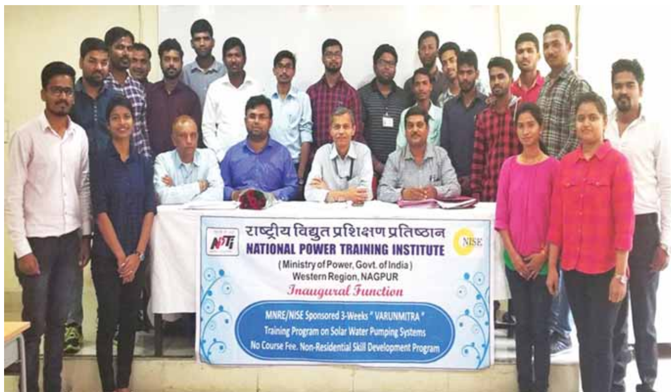
“Varun Mitra” Training Programme on Solar Water Pumping System at NPTI - WR, Nagpur

Venue : Faridabad Duration : 6 weeks Date : To be announced Who may attend : Supervisory staff working in Power Stations/Industry with to 10 year of experience.