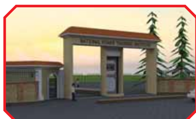
NPTI SHIVPURI MADHYA PRADESH