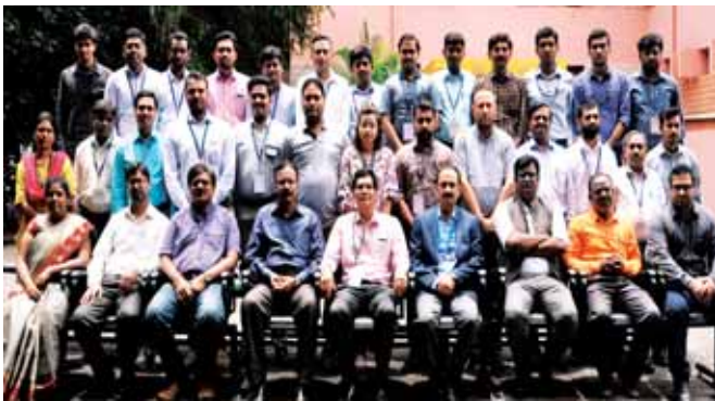
3 Days National workshop on "Recent Trends in Power System protection", August 29 – 31, 2018 at PSTI Bengaluru