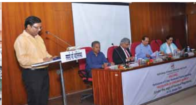
Two Days Residential Training Workshop on “Protection of Consumer Interest” for Officers of CGRF and Ombudsman, 11 th – 12 th October 2018 at NPTI CO. Faridabad