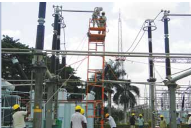
Training at HLTC - Live Line Maintenance Technique