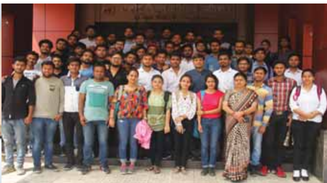
“One-Days Power Plant Familiarization Program” at NPTI CO., Faridabad