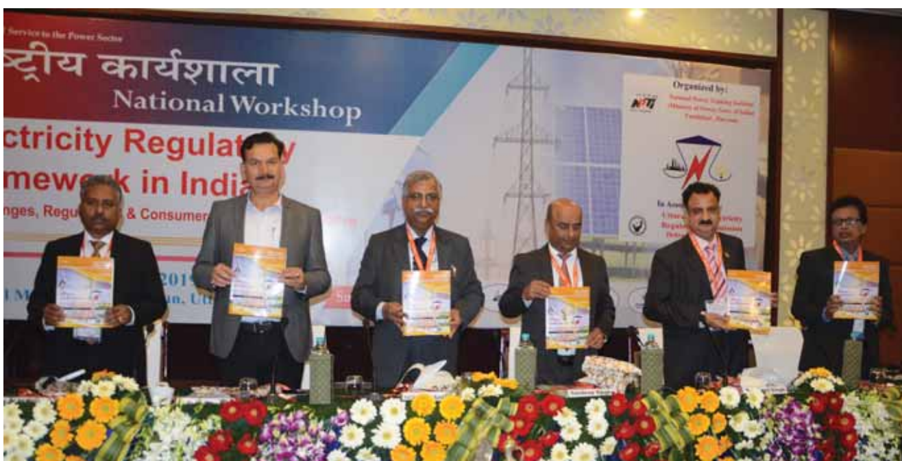
National Workshop on "Electricity Regulatory Framework in India- Challenges, Regulations and Consumer Protection Perspective", March 15, 2019 at Dehradun