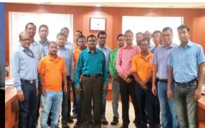
“ Turbine and Generator Protection (Sub and Super Critical Units) for the OPGC Engineers on 11th & 12th March 2019 Conducted by NPTI-ER, DGP at OPGC, Jharsuguda (Odisha).