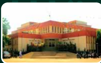
NPTI (WR) NAGPUR