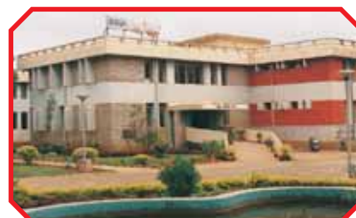
NPTI (PSTI) BENGALURU