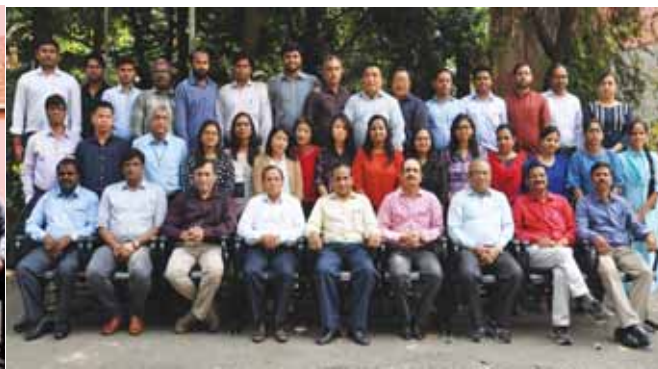
2 weeks training program on "Power System Operation", August 2018 at PSTI Bengaluru