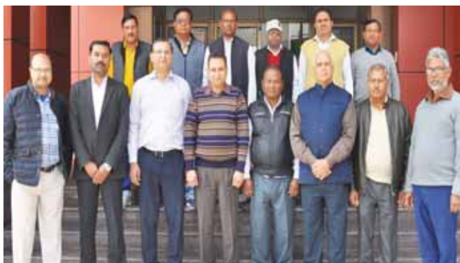
“Operation and Maintenance of Thermal Power Plant”, UPRVUNL JE Batch at NPTI (NR), Badarpur