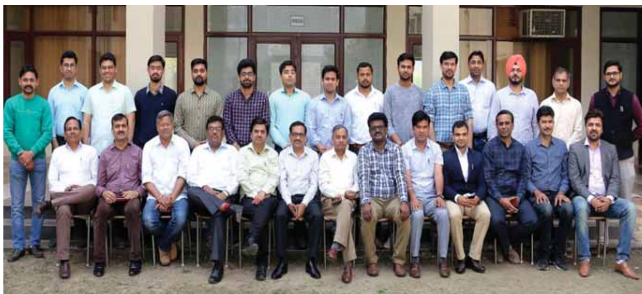
‘Optimum Utilisation of Power System Assets: Grid Security, Reliability and Distributed Monitoring Management’ March 27 - 28, 2019. At HVPN Power Training Institute, HPTI Complex, Panchkula