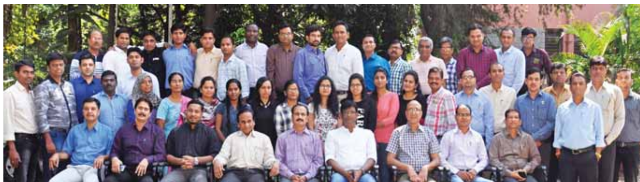
2 weeks training program on “Power System Operation”, Nov 19 – Dec 01, 2018 at PSTI Bengaluru