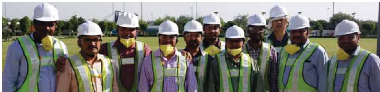
NTPC Meja participants visit at CLP Jhajjar.

Who may attend : This may be ideal for qualified Electricians wishing to expand or update their professional knowledge and skills and who are working with minimal or no supervision. It can be intended for Personnel in electrical contracting companies who have responsibility for the quality of the design, specification, installation and testing processes.