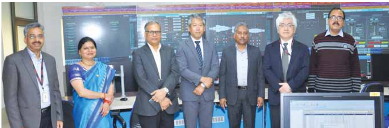
Officials of Toshiba visiting the Multi Functional Simulator at NPTI CO. Faridabad