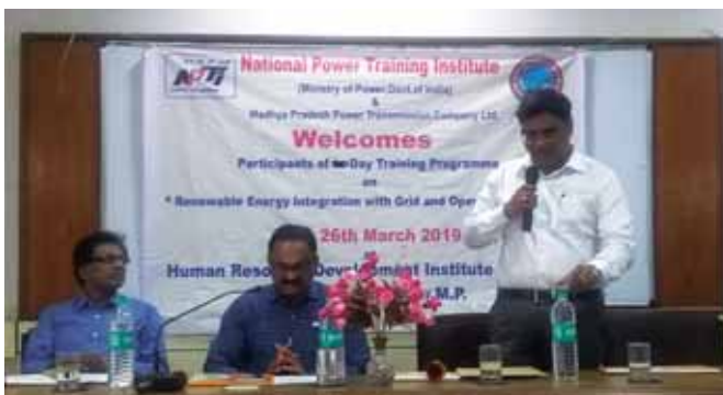
RE Grid Integration, on 25-26 March, 2019 at MPPTCL, Jabalpur, MP Conducted by NPTI FBD