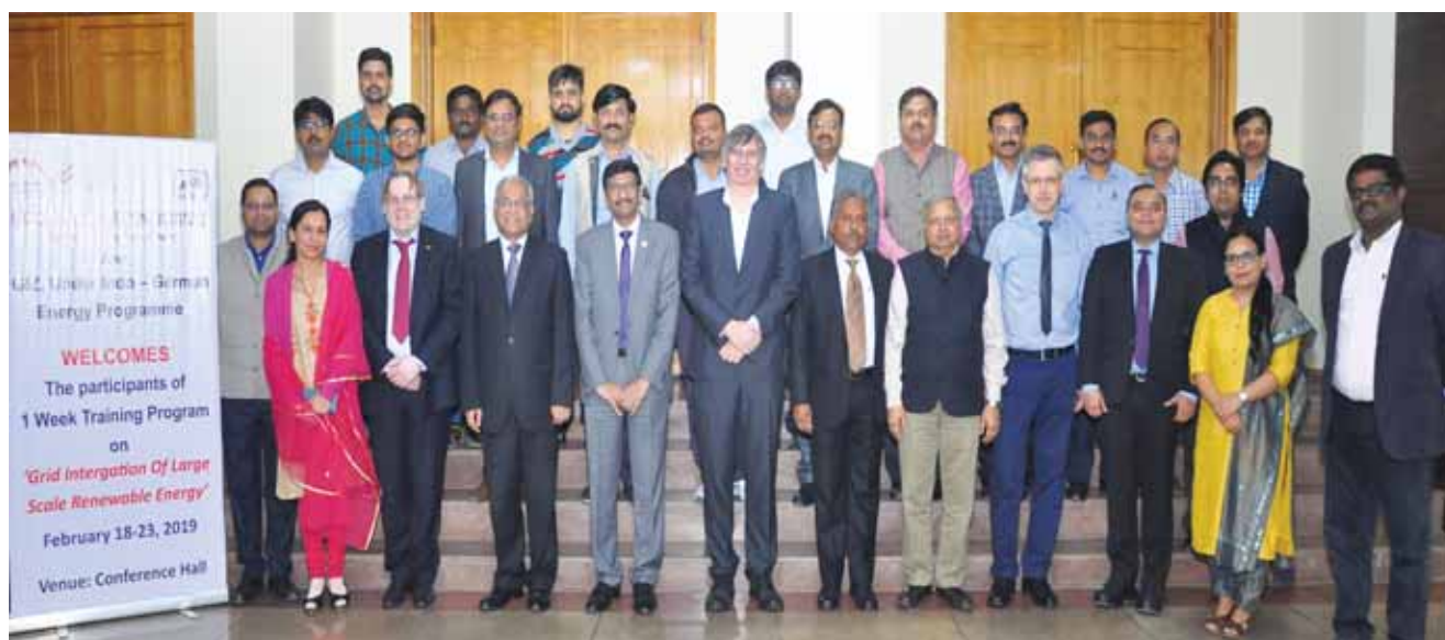
Grid Integration of Large Scale Renewable Energy, Feb 18-23, 2019 at NPTI CO. Faridabad