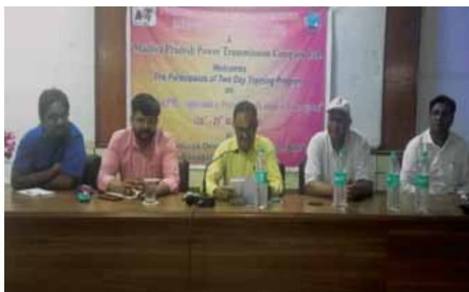
WAMS & PMU – Application in Protection & Control of Power System, March 28 -29, 2019 Conducted by NPTI FBD at MPPTCL, Jabalpur, MP