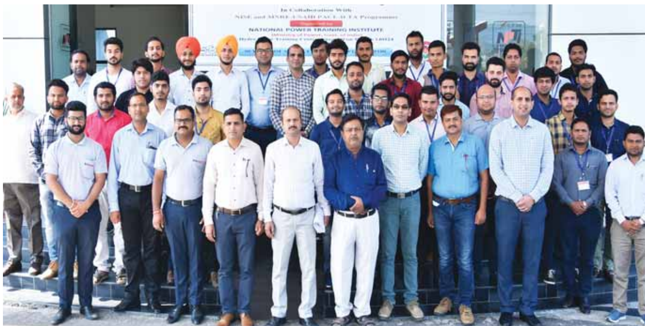
Entrepreneurship Development Program on Solar PV Rooftop at NPTI HPTC, Nangal

Nomination along with course fee for various courses may be sent to The Principal Director/ HoI of the respective institute at least 15 days in advance from the date of commencement of the course. Aspiring students for PGDC courses may visit the website www.npti.gov.in , and keep abreast with announcements of the various programs and may apply as per the instructions therein. The information and brochures of different workshops, seminars and conferences being conducted at NPTI are also available on the website. Application/ Registration to the workshops/ seminars/ conferences may be done as mentioned in the respective brochures.