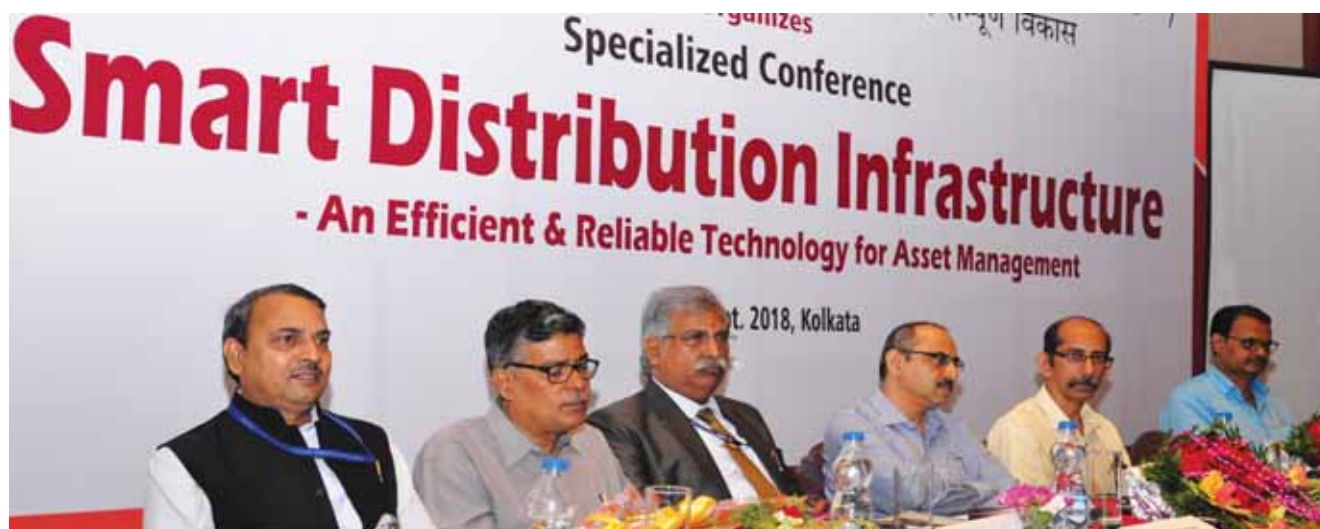
“Smart Distribution Infrastructure - An Efficient & Reliable Technology for Asset Management”organised by NPTI ER, Durgapur

Venue Duration Date Badarpur 1 week September 09, 2019 Durgapur 1 week July 22, 2019 Nagpur 4 days November 19, 2019 Who may attend : Operation Engineers with experience as Shift In-charge Engineers/ Operation Engineer.