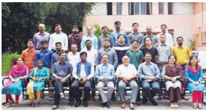
2 weeks training program on “Power System Operation”, May 28- June 09, 2018 at PSTI Bengaluru