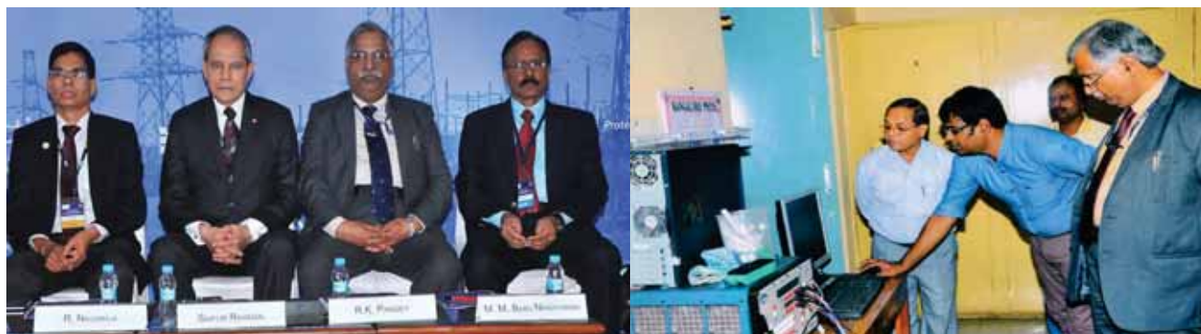
Testing facility at PSTI Bengaluru