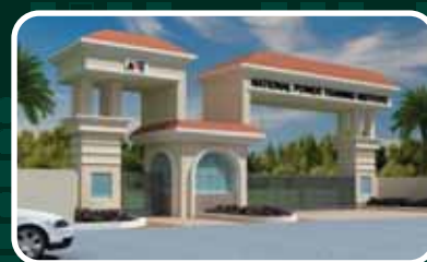
NPTI ALAPPUZHA KERALA