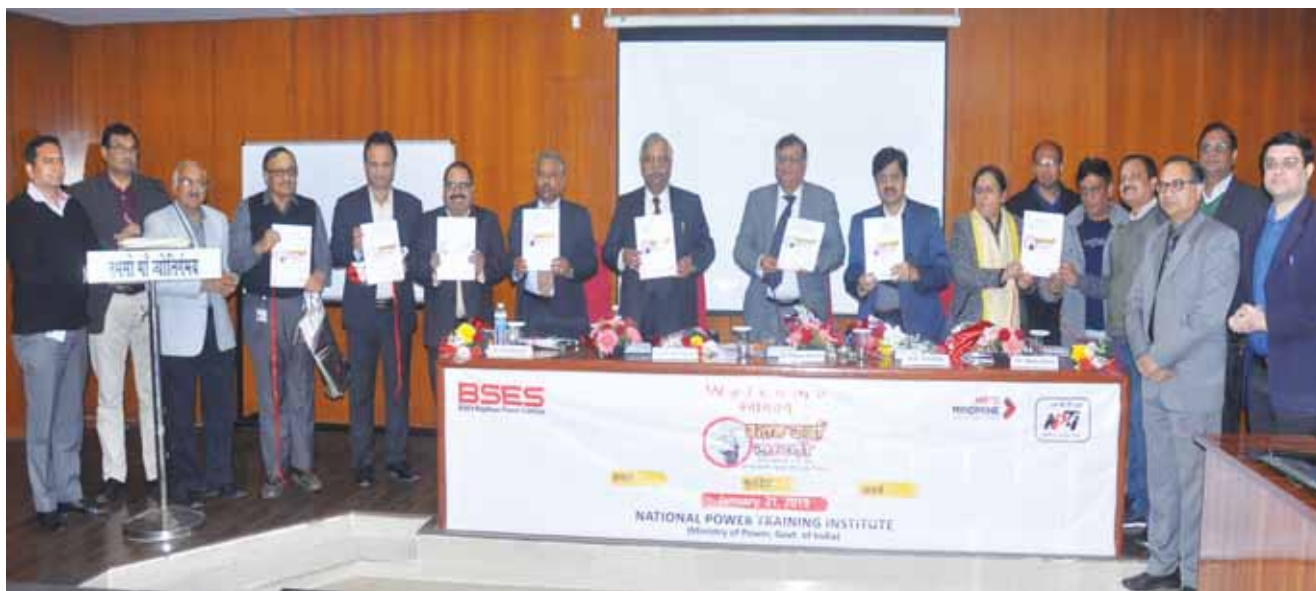
Manual unveiling, "Uttam Urja Saarthi" Training Program for BSES Technicians at NPTI CO. Faridabad