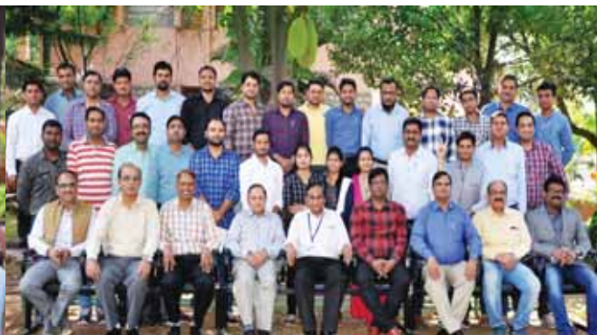
2 weeks training program on "Power System Operation", Jan 21, 2019 – Feb 02, 2019 at PSTI Bengaluru