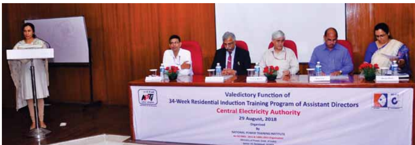
Valedictory Function of 34-Weeks Residential Induction Training Program of Assistant Directors at NPTI Faridabad