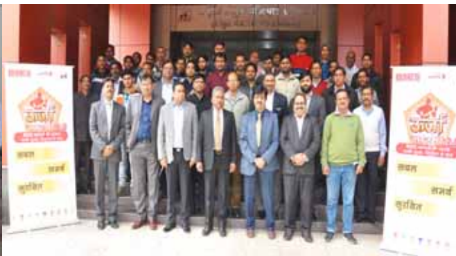
"Urja Saarthi 2.0" Training Program for BSES Linemen at NPTI CO. Faridabad