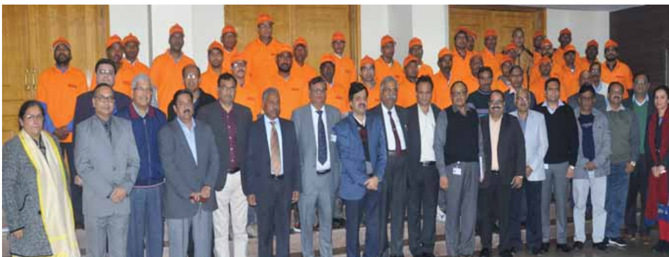
“Uttam Urja Saarthi” Training Program for BSES Technicians at NPTI CO. Faridabad