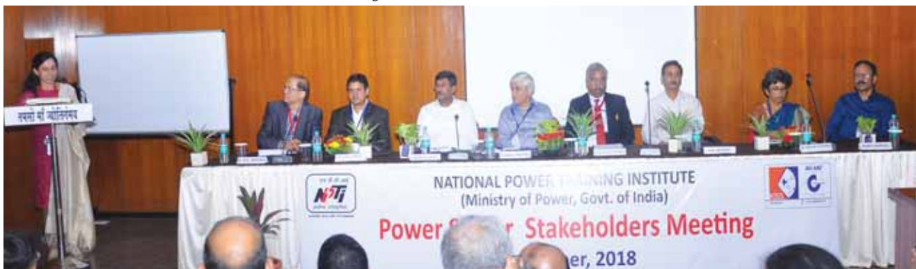
Power Sector Stakeholders' Meet, Oct. 03, 2018 at NPTI CO. Faridabad