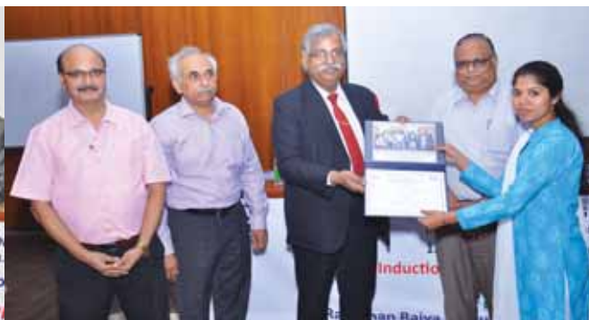
RRVUNL at NPTI (NR), Badarpur