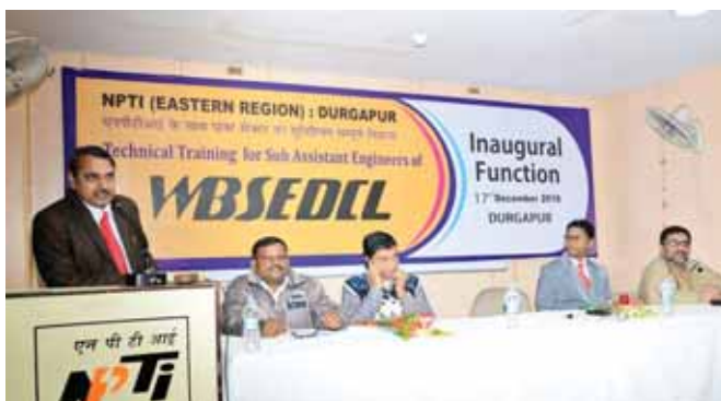
Inaugural Function of Technical Training Program for Sub Assistant Engineers of WBSEDCL on December 17, 2018 at NPTI Durgapur