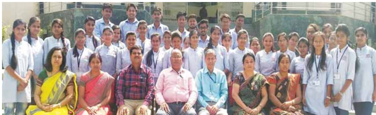
Power Plant Familiarization, Feb 25 – 29, 2019, at NPTI WR, Nagpur