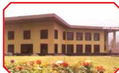
NPTI (NER) GUWAHATI