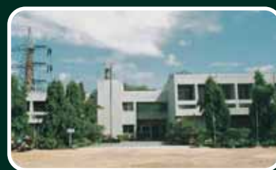
NPTI (NR) BADARPUR