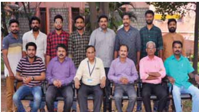
"Installation & Commissioning of Electrical equipment" for officers of Cochin Shipyard, Jan 23-25, 2019 at PSTI Bengaluru