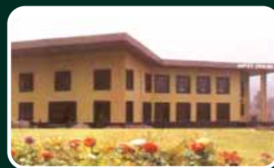
NPTI (NER) GUWAHATI