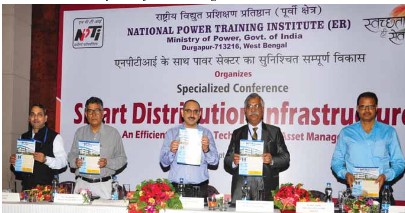
"Smart Distribution Infrastructure - An Efficient & Reliable Technology for Asset Management"organised by NPTI ER, Durgapur