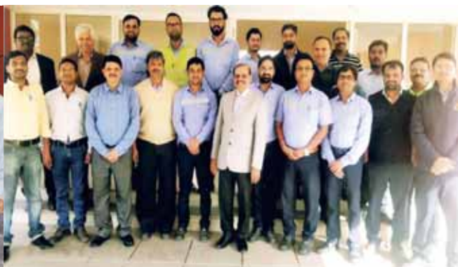
“Water Chemistry” for executives of Birla Cellulosic, Aditya Birla Group, Jan 22- 23, 2019