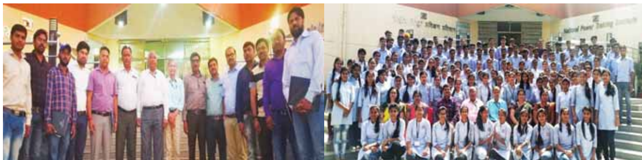
“Operation & Maintenance in 11 kV Power Distribution System” for Executives of Hindustan Copper Ltd., March 04 – 08, 2019 at NPTI WR, Nagpur

Who may attend : Foremen, Linemen, Asstt Linemen, Supervisors, Junior Engineers, asst. Engineers etc. actively involved in EHV Substation Maintenance activities having physical fitness. It is preferred that one of the nominee be from Executive cadre.