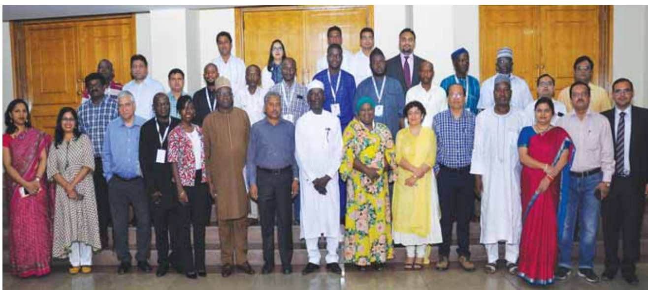
3 Weeks Training Program on Technical and Management Program for PIU Staff, Kaduna State, Nigeria