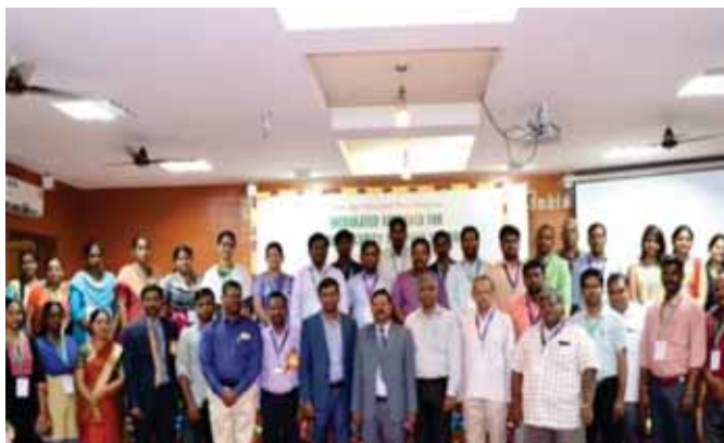
One Day National Workshop on “Integrated Approach for Cyber Security in Power Sector” Chennai on 28.11.2018