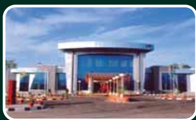
NPTI (HTPC) NANGAL