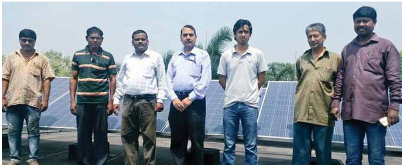
10 KW Solar Power Plant installed at NPTI ( Eastern Region) by DPL (now WBSEDCL) under MNRE scheme

cold lines may only be sponsored so that many of the techniques need not have to be repeated. It is preferred that the participants of the course should have been exposed to some of the Live Line Maintenance jobs at least a couple of years before they are sponsored for this training this will enable the trainer to ease his efforts by simply recalling those techniques and concentrate more on the techniques relevant to actual line situation that are needed. Supervisors in the rank of Junior Engineers and ITI qualified Technicians may be considered for this course.