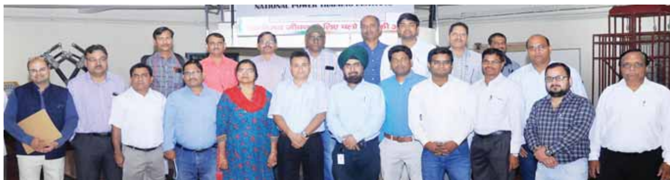
“Operation and Maintenance of HT/ LT equipments” conducted for Executives from GAIL, Oct 29 – Nov 01, 2018 at NPTI (NR), Badarpur, New Delhi