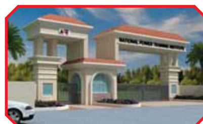
NPTI ALAPPUZHA KERALA

NPTI operates on an all India basis with man-power strength of 225 including 88 officers through its 9 Institutes in different zones of the country as per detail below: