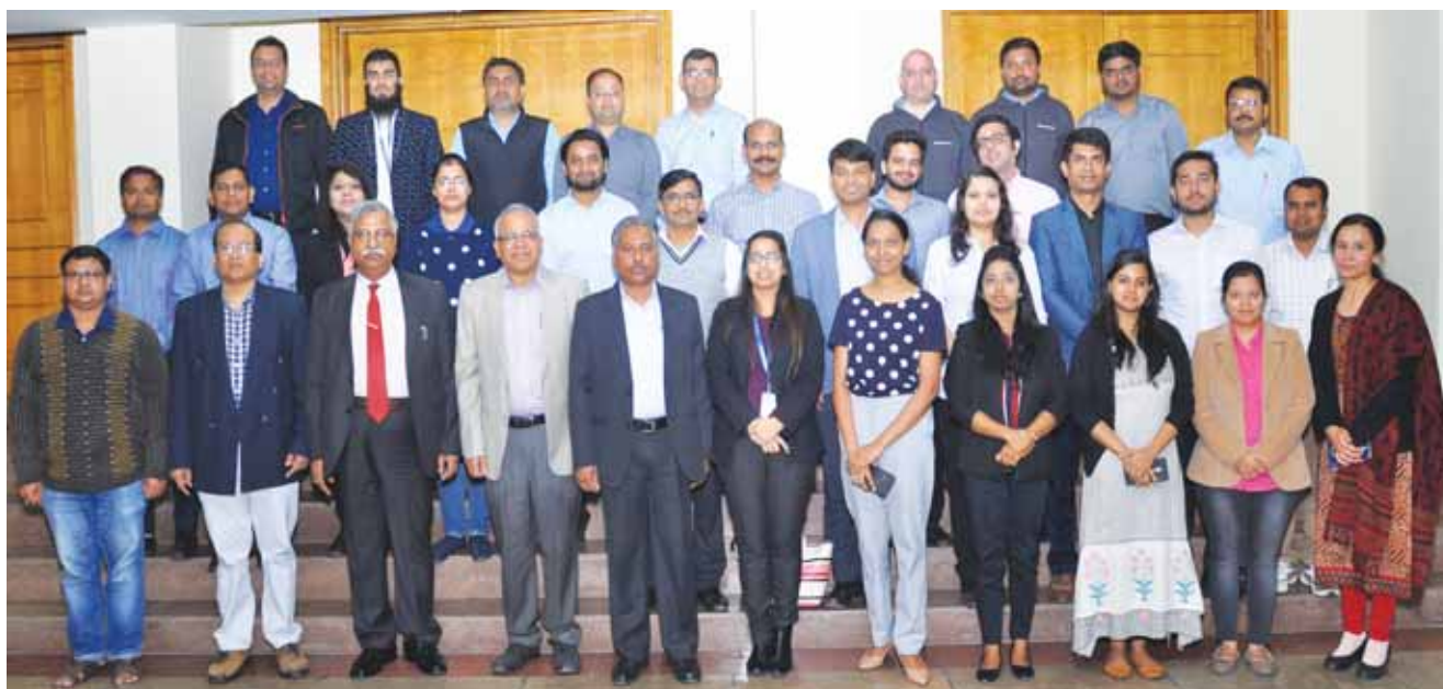
“Transmission for Non-Transmission Executives, Sterlite Power at NPTI CO. Faridabad

Note: For specialized courses/ on-site/ on-plant training programs, minimum number of participants should be 10. If number of participants is less than 10, then fee for 10 participants will be charged.